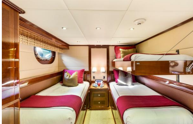
Guest Twin w/ Pullman