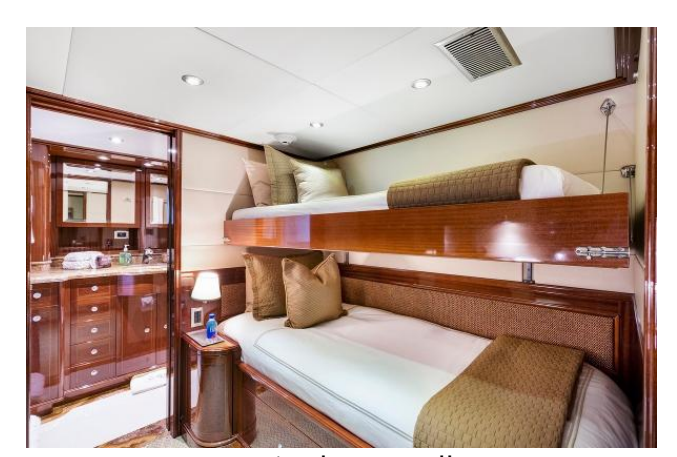
Guest Single w/ Pullman