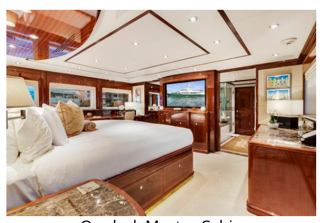
On-deck Master Cabin