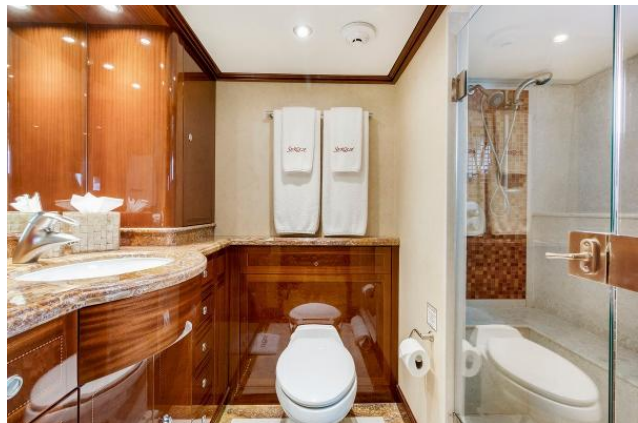
Guest Twin Bath