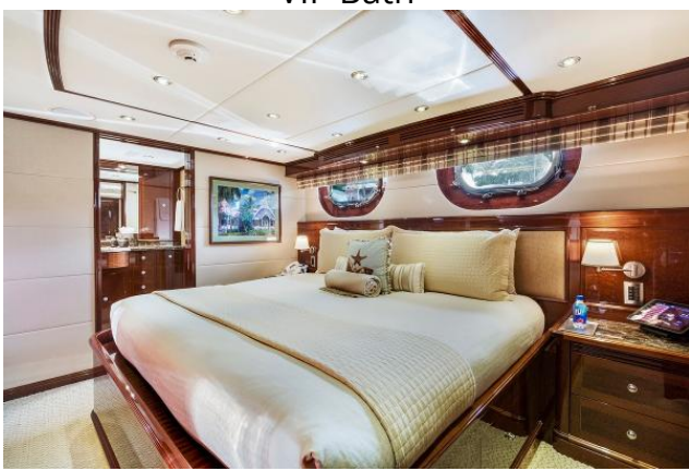
Guest King Cabin