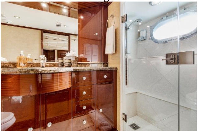
Guest King Bath