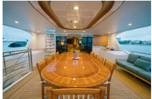
UPPER DECK ALFRESCO DINING AFT