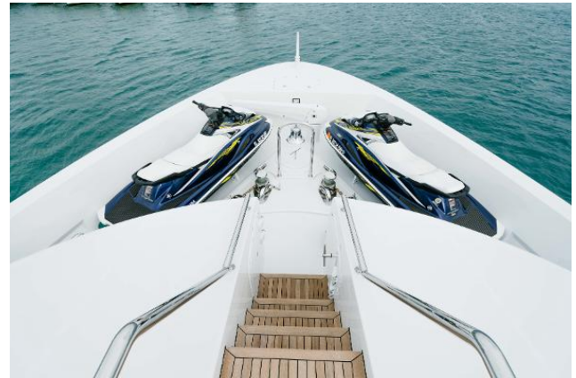
BOW WITH TOYS