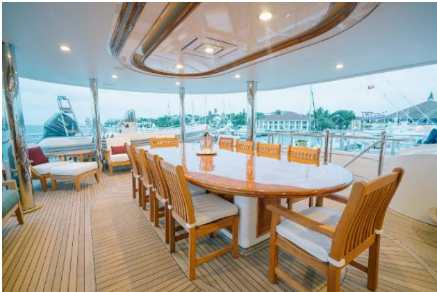
UPPER DECK ALFRESCO DINING AFT