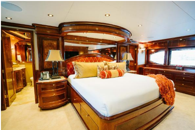
FULL BEAM MASTER