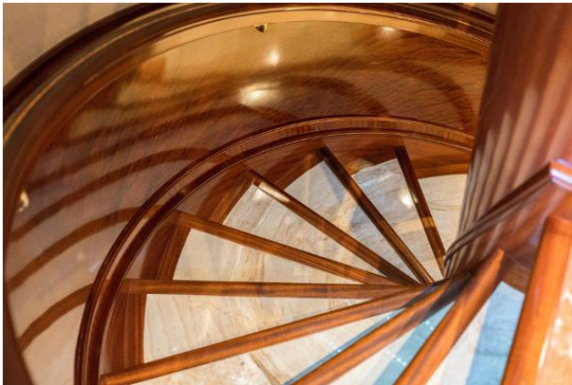
STAIRS TO GUEST AREA