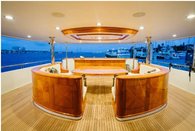
MAIN AFT DECK SITTING