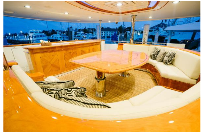
MAIN AFT DECK SITTING