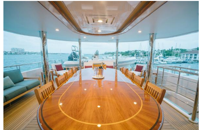
UPPER DECK ALFRESCO DINING AFT