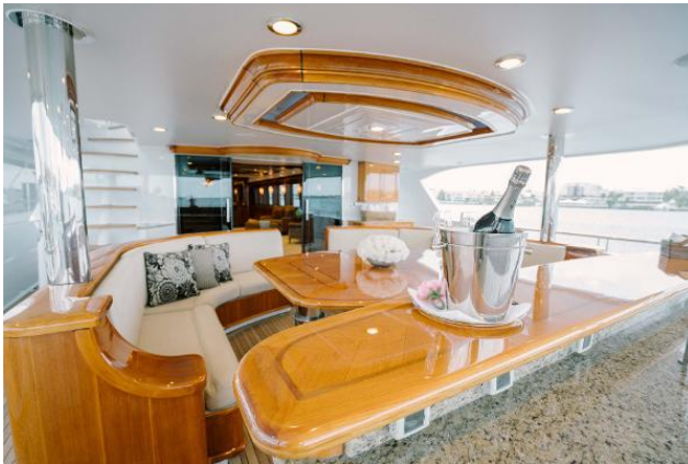
MAIN AFT DECK SITTING