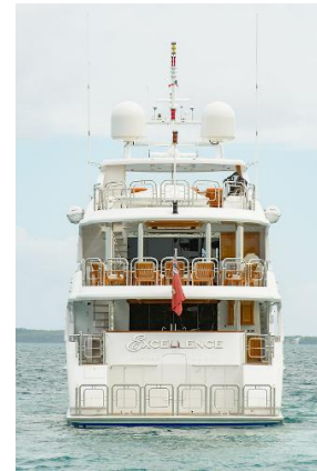
AT ANCHOR STERN