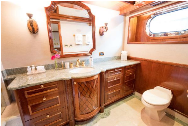
VIP ENSUITE BATH