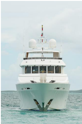
AT ANCHOR BOW