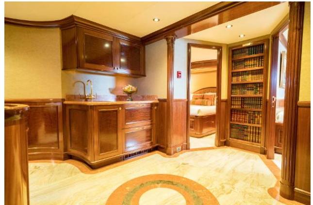
GUEST AREA FOYER