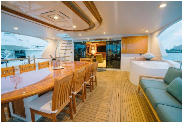
UPPER DECK ALFRESCO DINING AFT