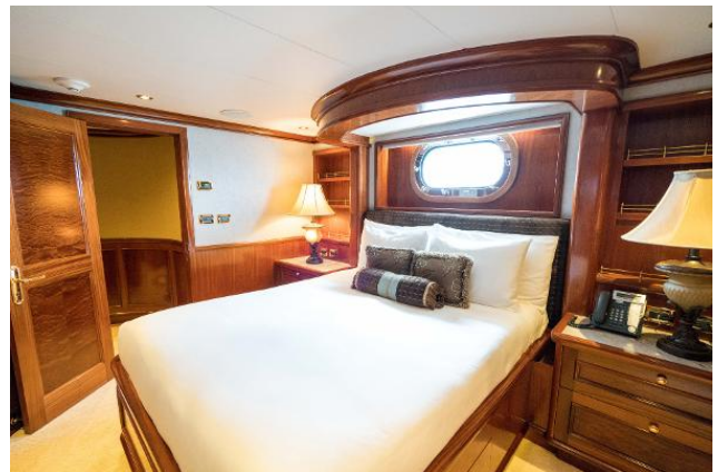
SECOND QUEEN STATEROOM