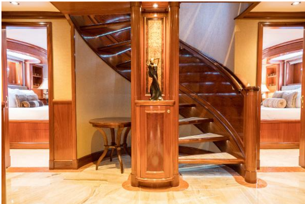
GUEST AREA FOYER