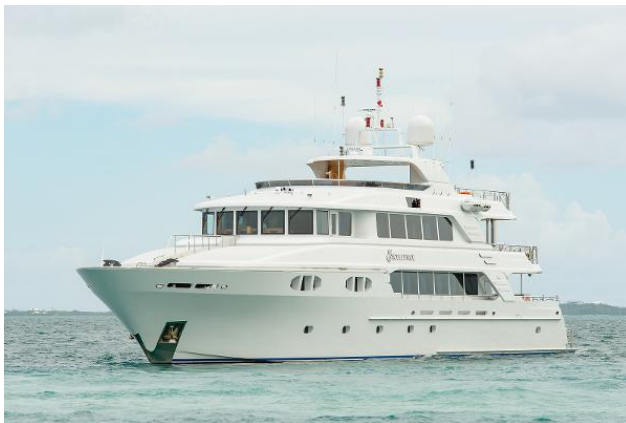
AT ANCHOR PORT