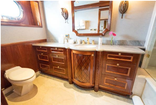
SECOND QUEEN STATEROOM ENSUITE BATH