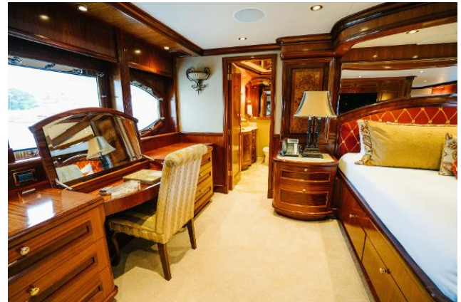
FULL BEAM MASTER