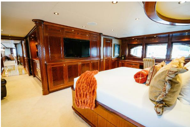
FULL BEAM MASTER