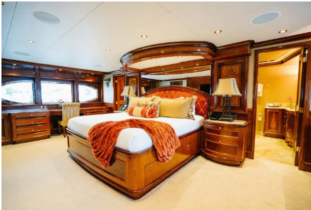
FULL BEAM MASTER