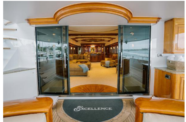
MAIN AFT DECK SITTING