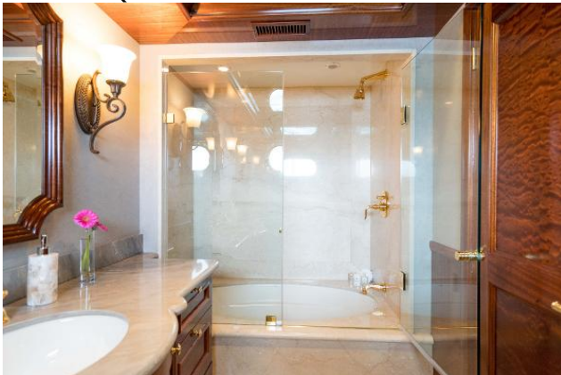
SECOND QUEEN STATEROOM ENSUITE BATH