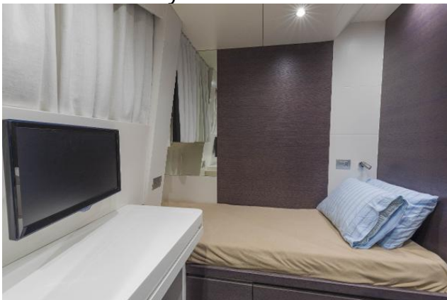
Captain's cabin on main deck