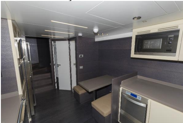
Galley and crew area