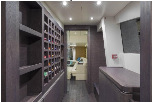
Lower helm entry