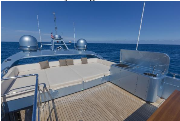
Flybridge grill, wetbar, sunpad