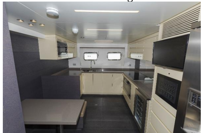
Galley and crew area