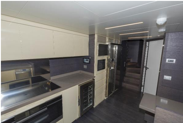
Galley and crew area