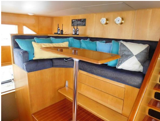
Pilothouse Guest Seating