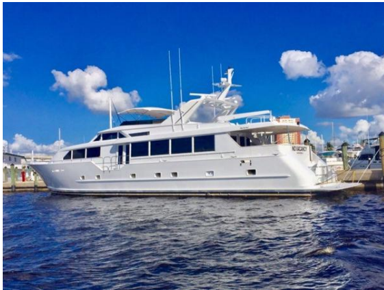
Port Aft Profile