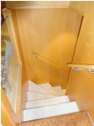
Aft Staircase to Accommodations