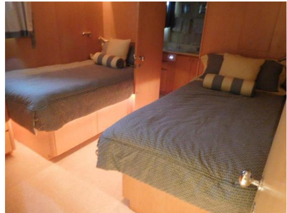
Starboard Twin Guest Stateroom