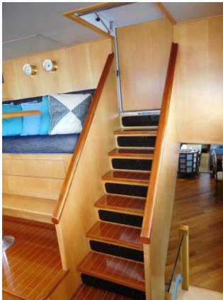
Pilothouse Stairs to Flybridge