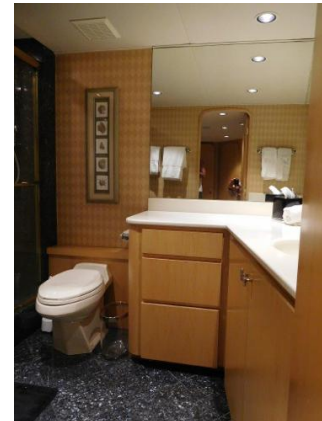
Master "His" Head