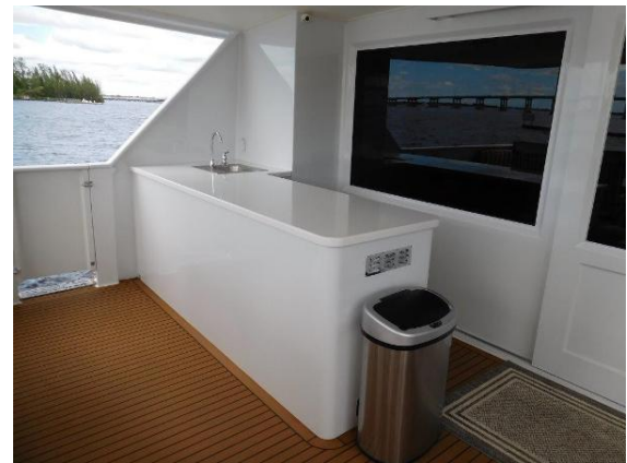
Aft Deck Wet Bar