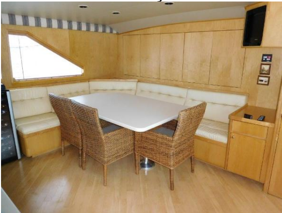
"Country Kitchen" Dlnette