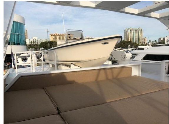
Flybridge - aft sun lounge and Tender