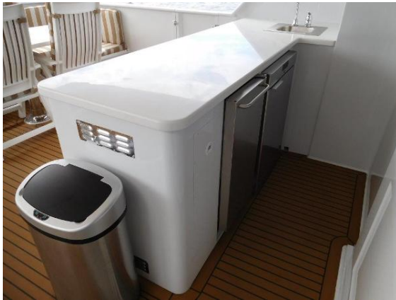
Aft Deck Wet Bar