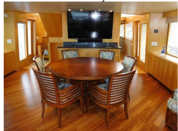
Dining and Salon looking forward