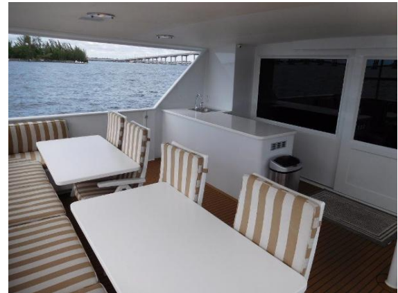
Aft Deck & Wet Bar