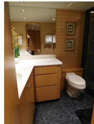
Master "Hers" Head