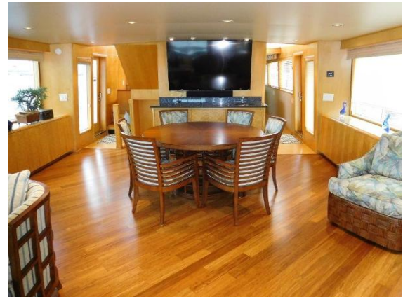
Salon/Dining looking forward