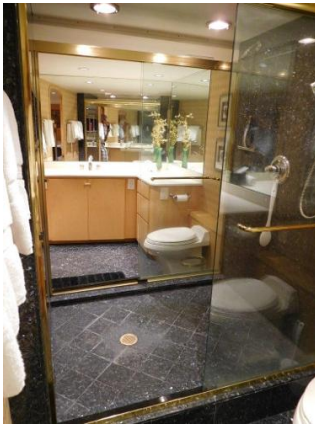
His & Hers Master Shower