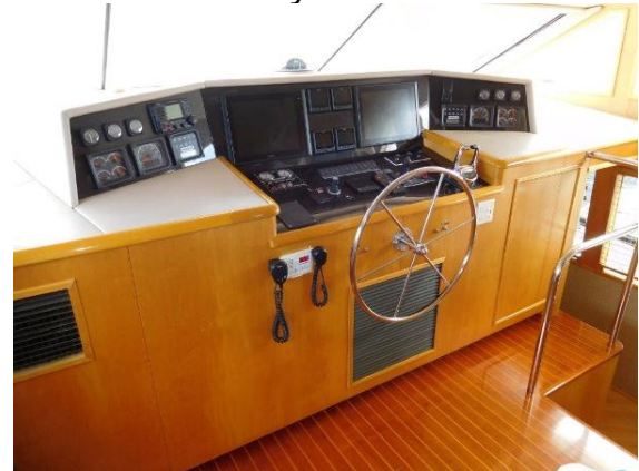
Lower Helm - Pilothouse