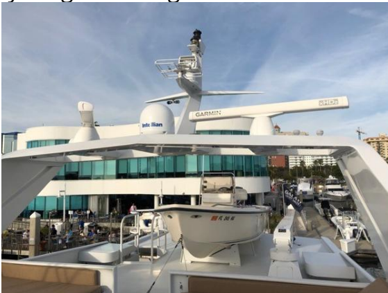
Flybridge - Radar arch