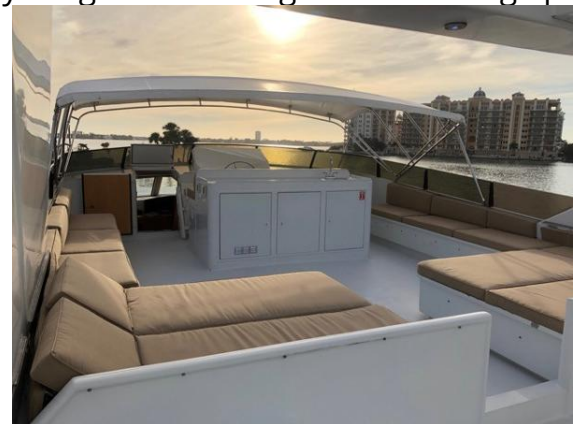
Flybridge - looking forward