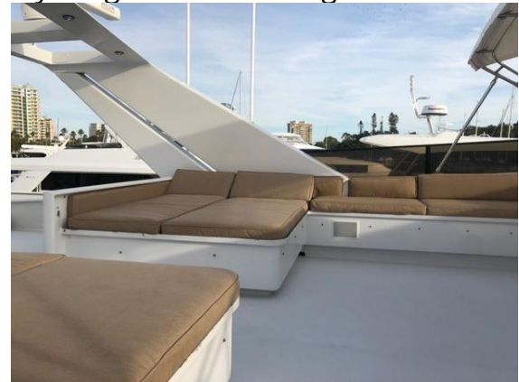
Flybridge - aft seating and sun lounge port