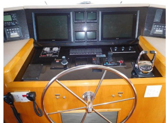
Lower Helm - Pilothouse