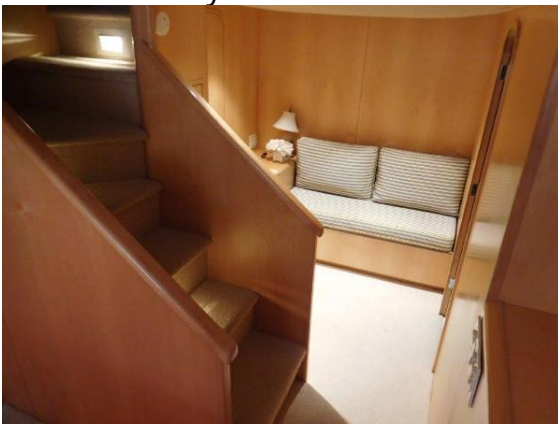
Forward VIP Suite - Private Access