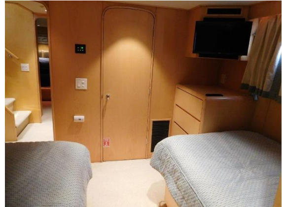
Starboard Twin Guest Stateroom