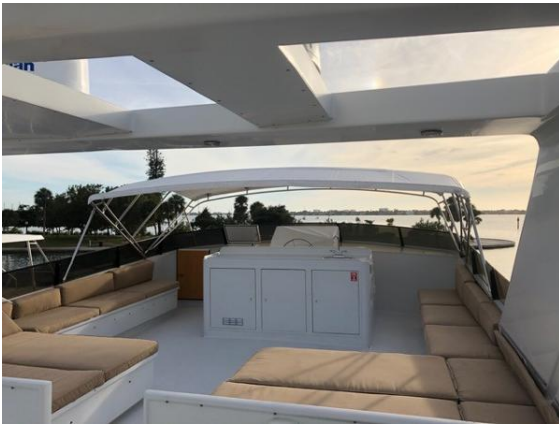
Flybridge - looking forward - under arch