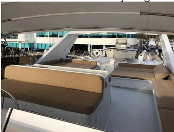
Flybridge - looking aft from Helm