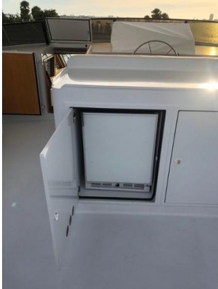
Flybridge - Fridge