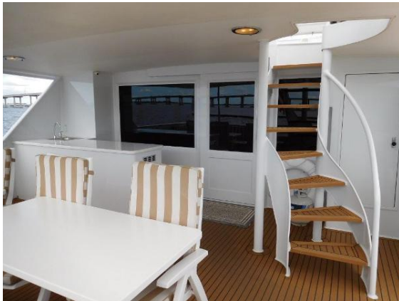
Aft Deck Staircase to Flybridge