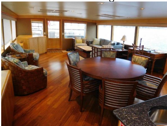
Dining & Salon looking Aft