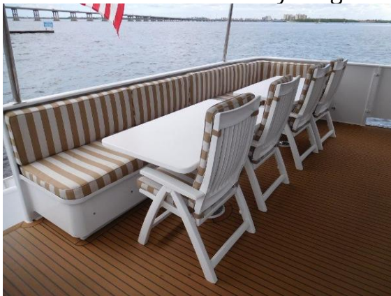
Aft Deck Seating and Dining