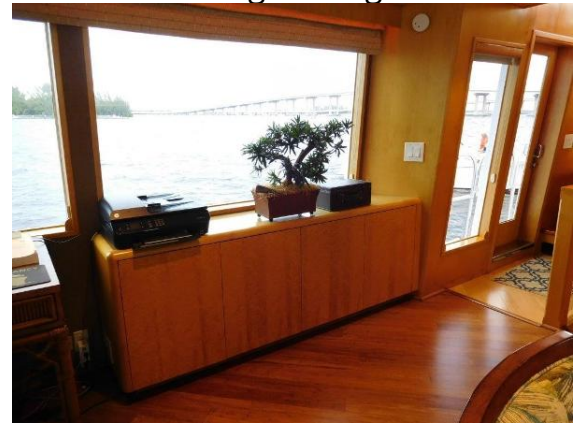
Salon Cabinetry Portside