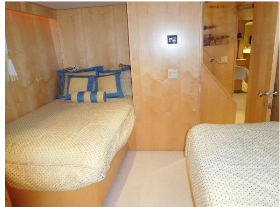
Port Twin Guest Stateroom